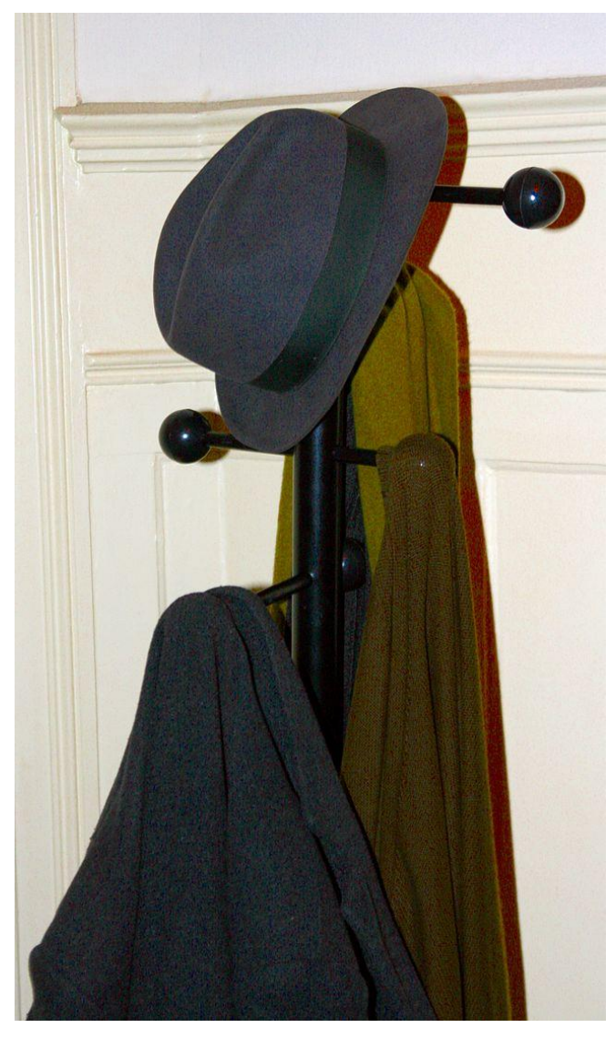
Coat Rack.